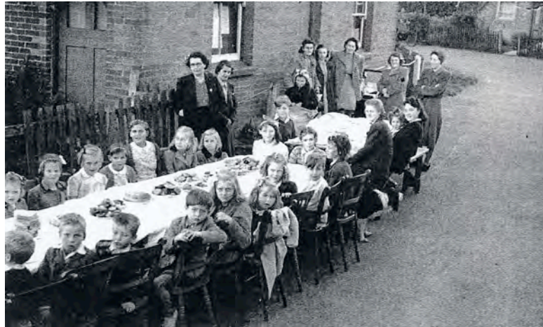
East Meon children celebrating VE Day

No school today. Many bombs were dropped and several roads were closed temporarily on account of unexploded bombs