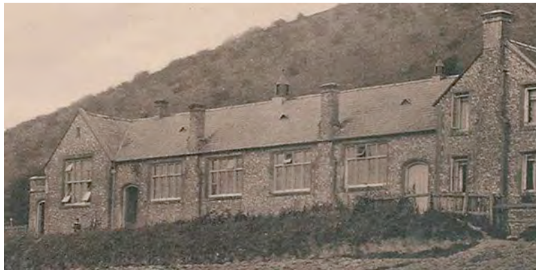
Above, the land donated by the Bishop of Winchester for the building of the School, 1845. Below, the National School in the early 1900s