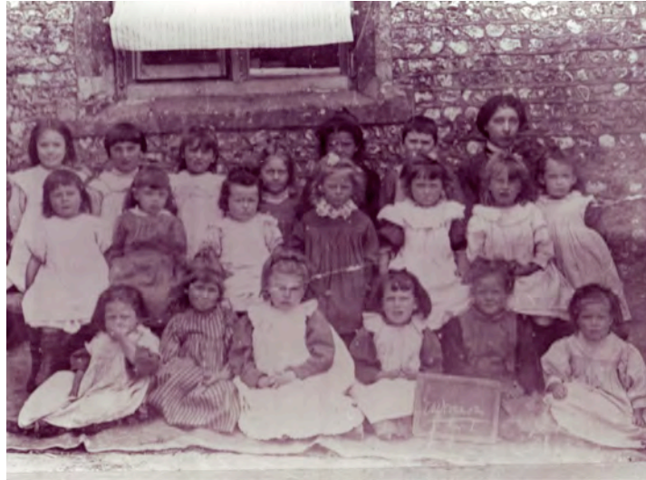
Class of girls, date unknown