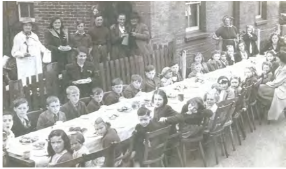
Village children at tea outside the Institute. Note the adult helpers dressed as 'country yokels'