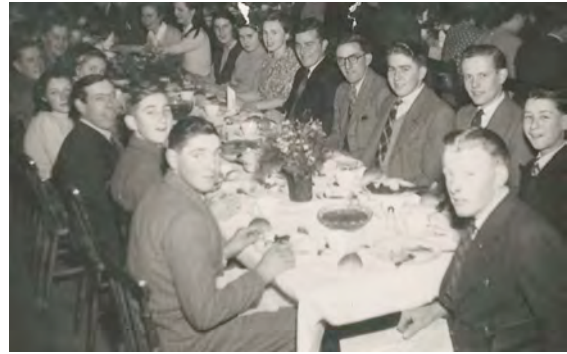
Blackman family photograph of a dinner in the Institute, post WWII.

To read the minutes, or summaries, click on