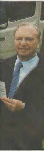
Community Bus and

ash son, policy advi- made the presenta- as set up in 1974, year carried about took to the roads another 12 volun- ried 6,000 people was launched in and last year car- ome extra volun- can be contacted 243 605353 and