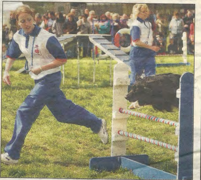
Performance by Solent Dog Display Team. 061202-9