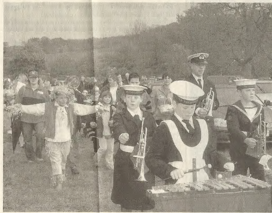
Above: The young entrants in the fancy dress competition.