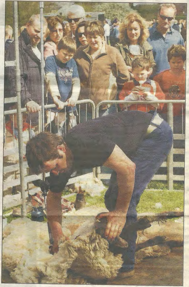
The crowds watch some sheep sheering. 061202-8

Other activities during the day included skittles, egg throwing, a bouncy castle, a tea and beer tent and live music.