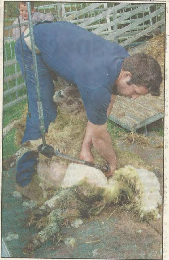
Visitors even learnt how to shear a sheep. (PD18-17-05)