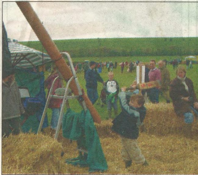
A keen youngster tries to splat a rat at the fair.

A VILLAGE plumped for tradition over trade at its country fair.