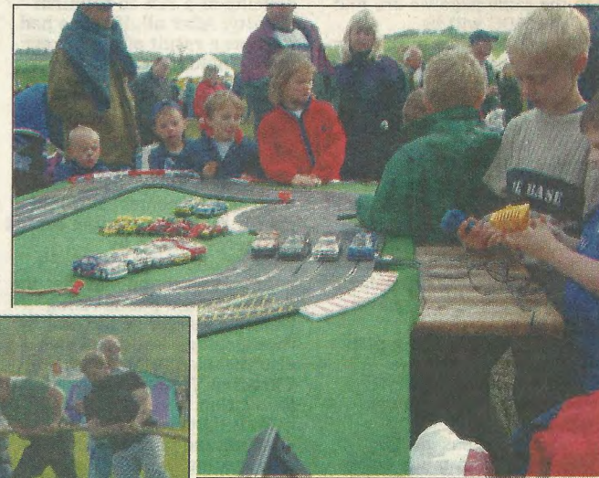
Race track fun for these youngsters (above). The tug of war in full swing (left).

All profits from the event, held on Fair Field, South Farm, went to the village hall.