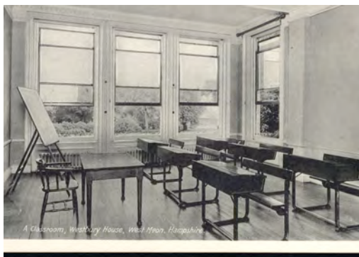
A Classroom, Westbury House, West Meon, Hampshire