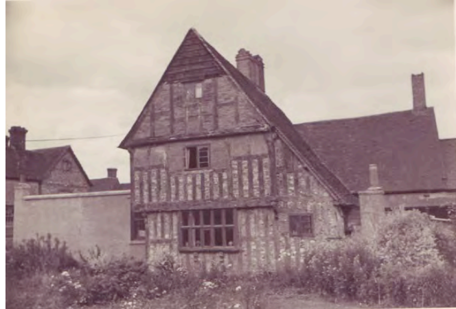
The shop extension can be seen on the left, and the outside toilet on the right.