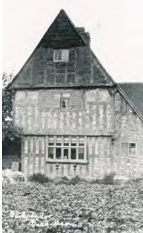
The Tudor House, with overgrown garden